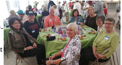
Jasmine members and guests enjoying the Spring Garden Party

Oh my gosh, it’s that kind of berserk time of year again. First the camellia blooms light up gardens and all of a sudden it’s Spring and every azalea is showing off. And, our members are working their hardest too to get ready for a wonderfully busy March and April.